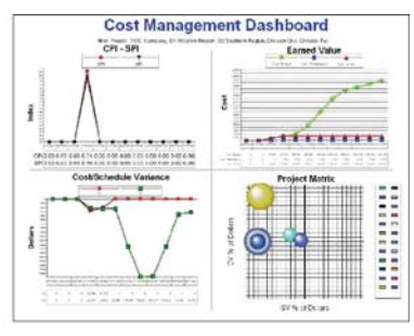
Figure 2: Comprehensive data for analyzing budget, actual, and forecast cost along with ata-glance views of leading indicators